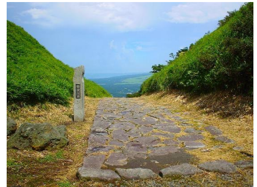
Futae no Toge