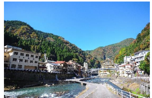
Tsuetate Hot Spring